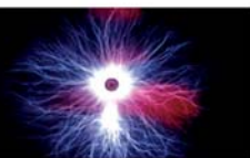
KIRLIAN PICTURE Negative Ions

The gemstones Tourmaline and Amethyst are known to emit negative ions. Negative ions are invisible, odorless molecules that we come into contact with in certain environments including evaporating water, ocean surf, and around waterfalls.